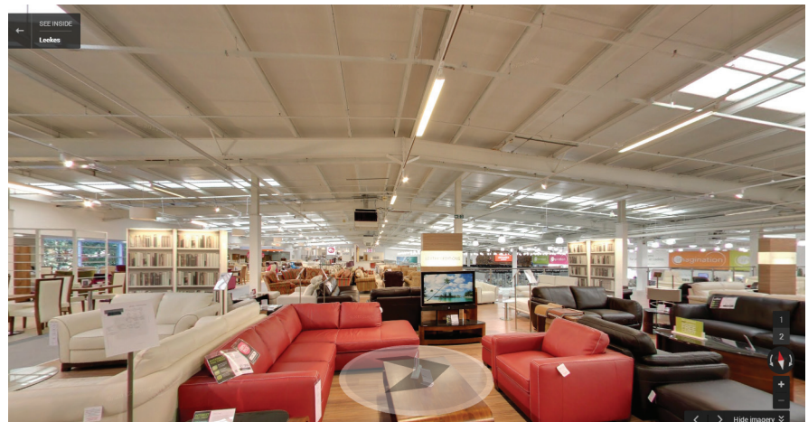
Business View in the Leekes Coventry store.